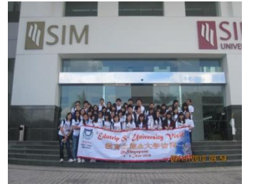
Indonesia November 2010