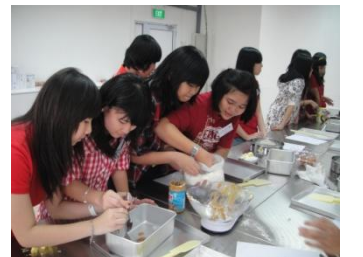
Indonesia April 2011