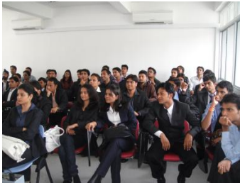
India August 2010