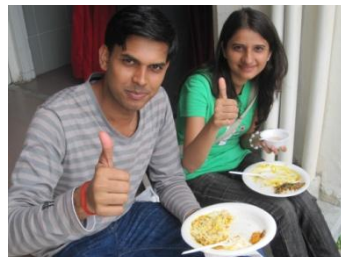
India March 2011