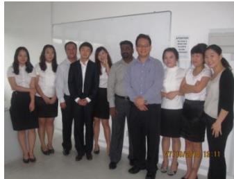
Korea August 2010