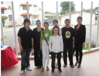
Vietnam December 2010