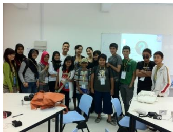
Indonesia February 2011