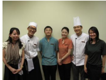
Korea September 2010